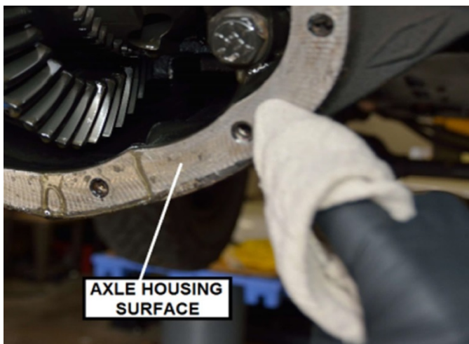
AXLE HOUSING SURFACE